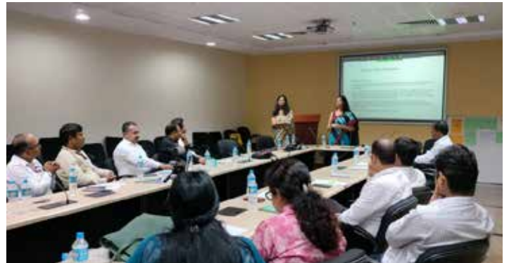
POSH (NHPC) 25-27 September 2023