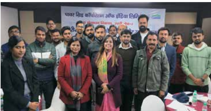
Holistic Wellbeing (KRIBHCO) 30 November - 3 December 2023