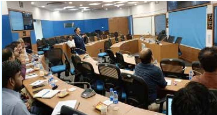
Prevention of Sexual Harassment at workplace (RITES) 27 July 2023