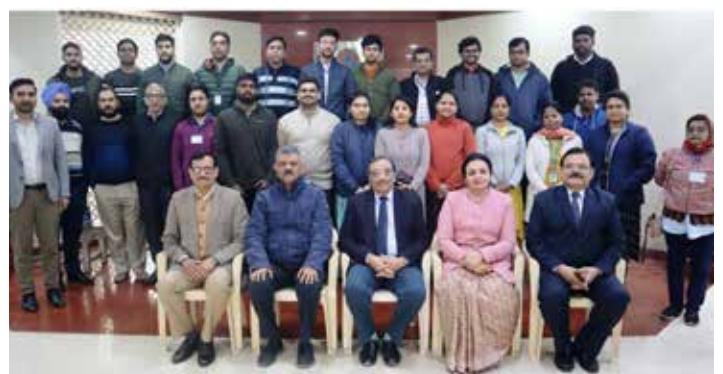
Data analytics for bankers (PSB) 26-30 December 2023