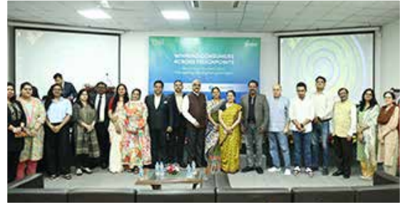
Retail Tech Summit 2024