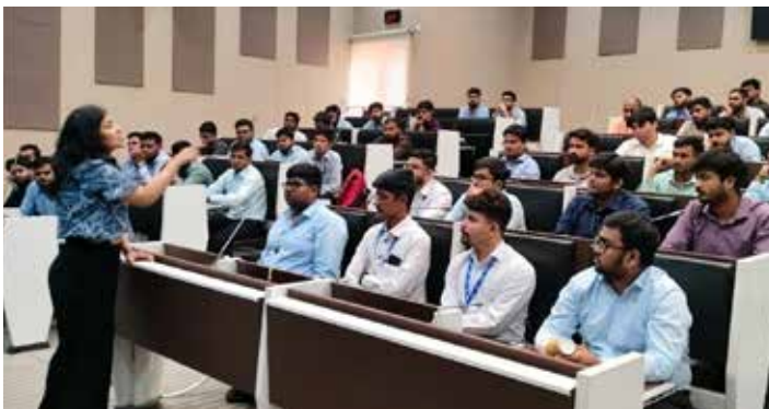
Business etiquettes and team building (NTPC) 6 May 2024