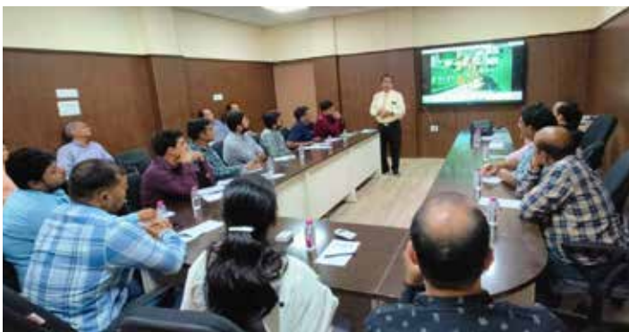
Finance for non-finance (GAIL) 24-26 July 2024