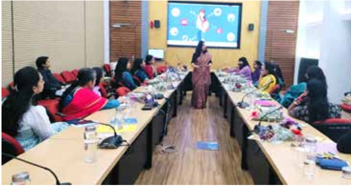
Women's day celebration (POSOCO) 8 March 2024