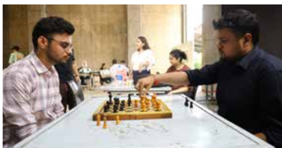
Annual Sports Meet