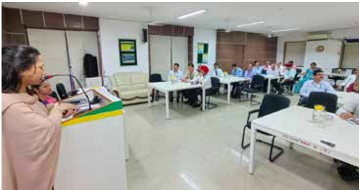
Achieve and excel- motivational program (PSB) 15-16 July 2024