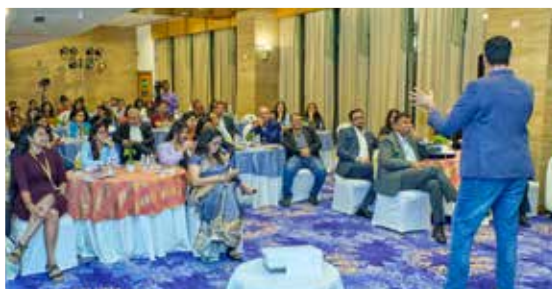
Corporate Meet & Greet