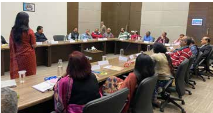
Mindful second innings (EIL) 5 December 2023