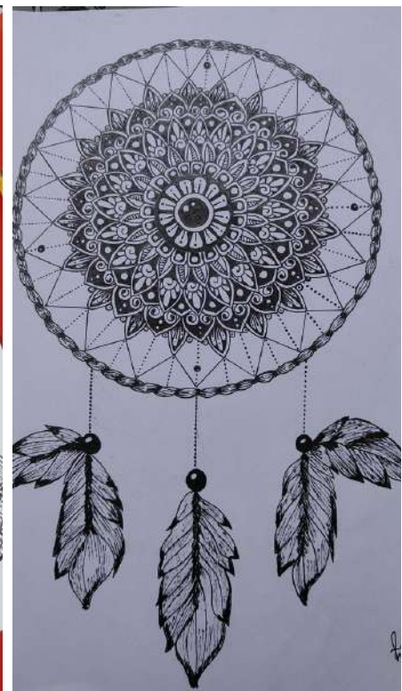
By Ritika Jain