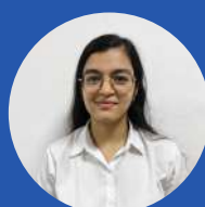
Ritika Content Creator