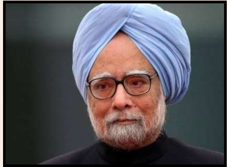
A TRIBUTE TO DR. MANMOHAN SINGH: THE ARCHITECT OF MODERN INDIA'S ECONOMIC REVIVAL

Each scene unfolded a story of dilemmas, strategies, and leadership, followed by thought-provoking discussions on their relevance to modern management. From teamwork and decision-making to ethical leadership, the activity offered invaluable insights, proving that the lessons of the Mahabharata remain as relevant today as ever.