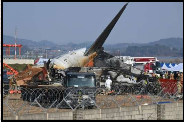
Jeju Air Flight 737-800 Crash in South Korea

On December 29, a Jeju Air Boeing 737-800 carrying 175 passengers and six crew members crashed at Muan International Airport in South Korea, resulting in the tragic loss of nearly all on board. Preliminary investigations suggest a bird strike and the proximity of an embankment to the runway as potential causes. This incident has reignited concerns regarding the safety record of the Boeing 737-800 model.