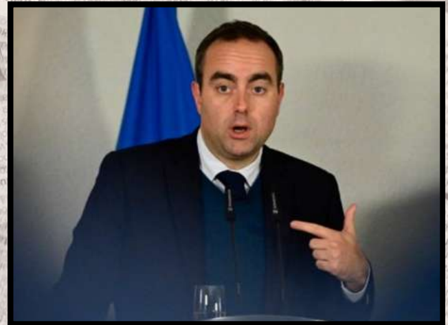
France conducts airstrike on Islamic state targets in Syria

In late December, French military aircraft carried out bombing raids on Islamic State positions in Syria. These operations marked France's first strikes in the region since the fall of Bashar al-Assad. The offensive aimed to dismantle remaining terrorist strongholds and support the stabilization efforts of Syria's new government, which has integrated former foreign fighters, including jihadists, into its armed forces.