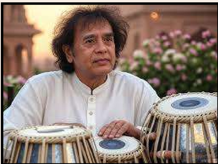
A TRIBUTE TO USTAD ZAKIR HUSSAIN: THE MAESTRO OF RHYTHM AND SOUL

Ustad Zakir Hussain, a legendary tabla virtuoso, has left us, but his legacy will continue to resonate through his timeless rhythms. Born into a legacy of musical brilliance from his father, Ustad Alla Rakha, he elevated the tabla to international acclaim, blending tradition with innovation. His groundbreaking works like Shakti and Planet Drum, which earned Grammy Awards, showcased his unmatched artistry.