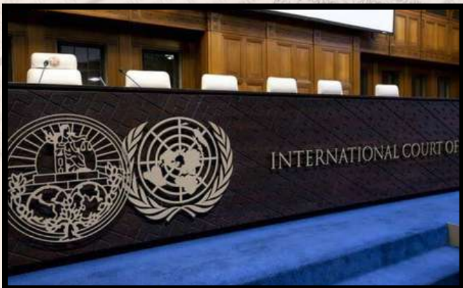
International Court of Justice Begins Landmark Climate Change Hearings

On December 2, the International Court of Justice (ICJ) commenced hearings to determine the legal obligations of countries in combating climate change and supporting vulnerable nations. Prompted by a request from the UN General Assembly, the hearings involve representatives from over 100 countries. The ICJ's advisory opinion, expected in 2025, aims to clarify states' legal responsibilities and emphasize the urgency of effective climate action.