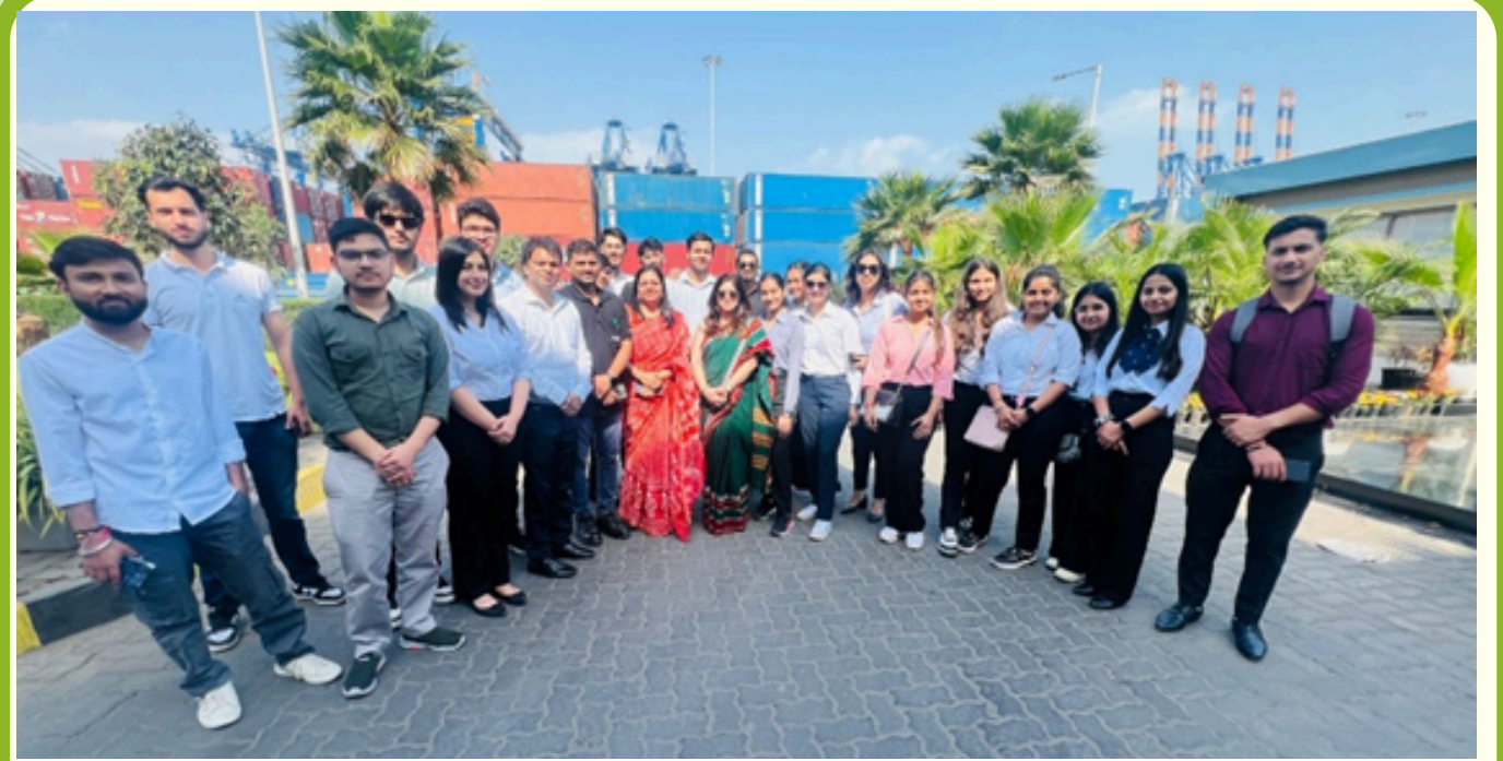
ADANI PORT, MUNDRA

The Department of International Business at JIMS Technical Campus, Rohini, organized a sea port visit for first-year PGDM IB students to Mundra (Adani) Port, Gujarat, on Feb 22, 2024. Situated on the northern shores of the Gulf of Kutch, Mundra Port is India's foremost private, container, and commercial port, pivotal to the nation's economic growth. Guided by port officials, students gained insights into cargo handling, logistics, and overall port operations, including visits to container terminals and cargo handling areas. The tour included a visit to the port model room, showcasing the vast expanse of port operations in the Mundra region and its advanced infrastructure. Students witnessed first-hand the port's operations, emphasizing its status as India's largest commercial port and its commitment to cutting-edge infrastructure.